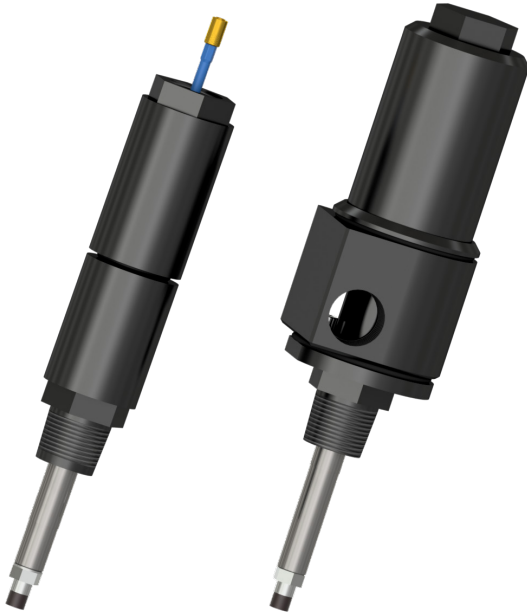
PRO Line reverse mount proximity probe housing assembly allows eddy current probes to be mounted as deeply into machines as 12.2 inches

Easily adjust the gap between the machine shaft and probe without shutting down a machine.